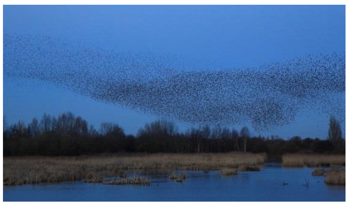
Starling murmuration on No.3 bed

The ringing teams collectively recorded a total of 115 newly ringed and 14 retrapped, from previous years. No.3 bed team ringed 67 new, the lowest total of the last 12 years and comes after the 2014 record total of 118. Their 12 year average is 94. In contrast, No.1 bed with 48 ringed was a reasonable number for the bed. There were nine retrapped on No.3 bed, four originally ringed in 2014, two from 2013, two from 2012 and one from 2011. The oldest of the five retrapped birds caught on No.1 bed was originally ringed on 15<sup>th</sup> October 2011. The first fledged juveniles were ringed on 27<sup>th</sup> June (over three weeks later than 2014) on No.3 bed and two weeks later on 10<sup>th</sup> July on No.1 bed. Eleven were caught in breeding condition on No.1 bed, five females and six males.