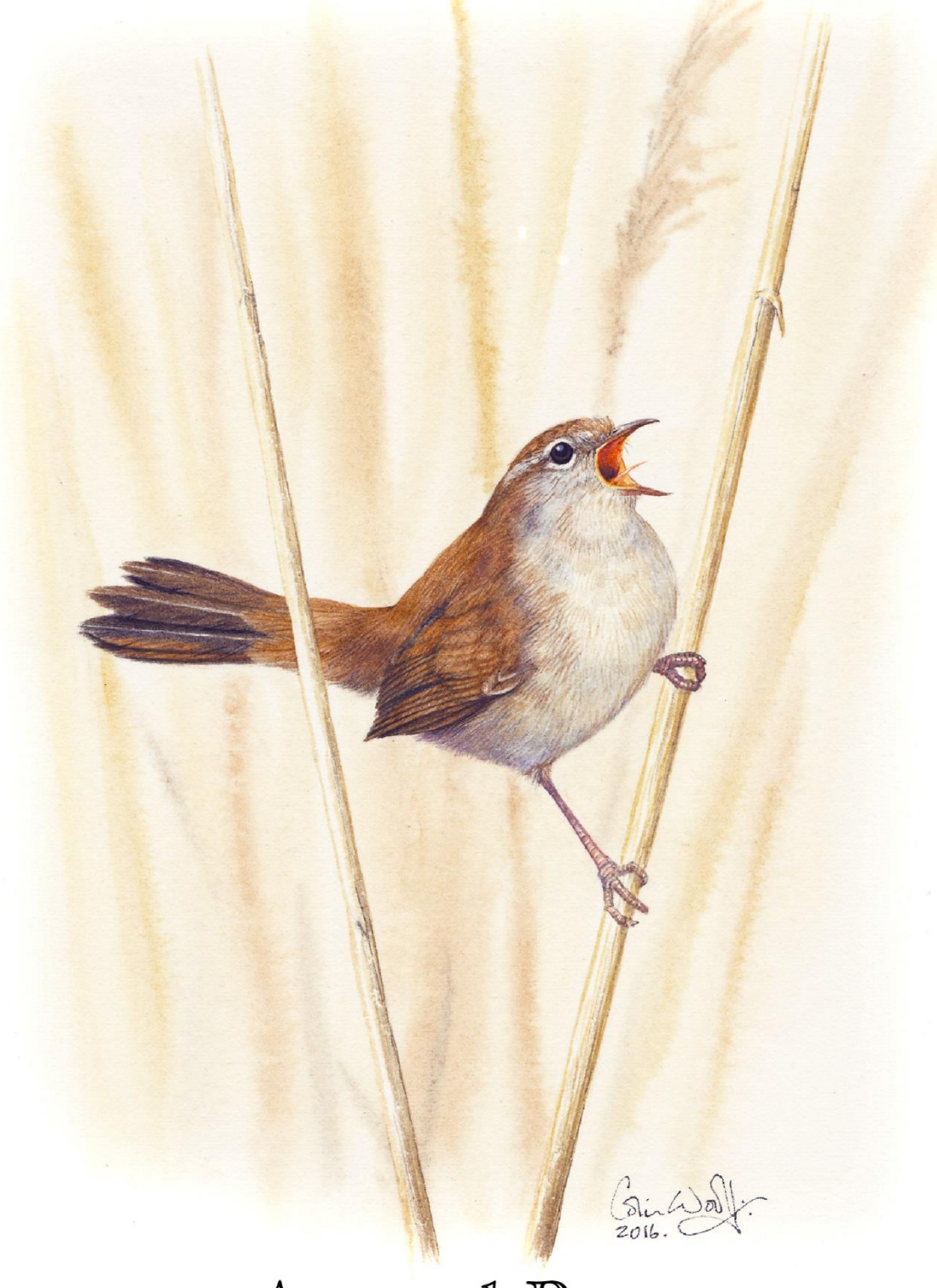
Annual Report 2015