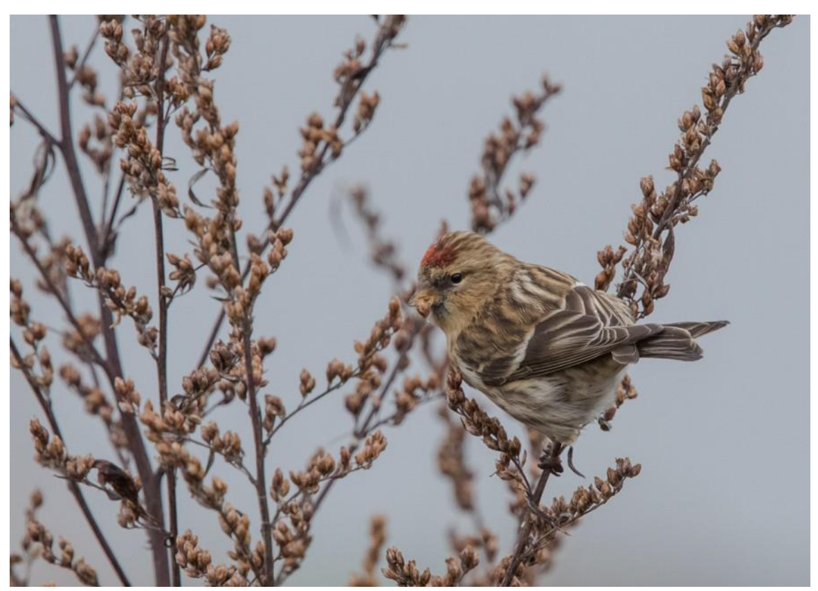
Lesser Redpoll feeding in front of the John Morgan hide

female. October was the peak month on No.1 bed, with 47 ringed. It was a contrasting experience on No.3 bed with just 15 of these lovely finches ringed. This compares with a twelve year average of 27.