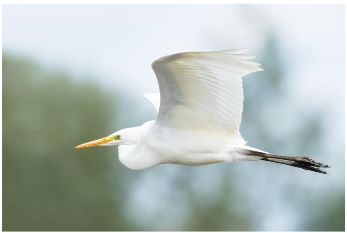
Great White Egret on No.3 bed

the only other double-figure count, but six to eight were reported on a number of dates up to the end of the year.