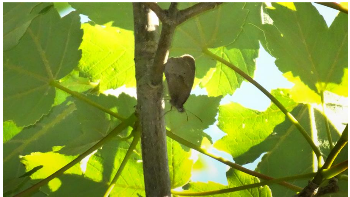
Purple Hairstreak on the south bank of No.3 bed

This species fared poorly this year and butterflies were hard to find, even when conditions appeared favourable. The first was seen on 20<sup>th</sup> July on the south bank of No.3 bed and there were a number of further reports, all of one butterfly, from this area. The highest count of the year was of six on the evening of 12<sup>th</sup> August, again on the south bank of No.3 bed. Unusually, four of these were found in Sycamores rather than their usual habitat of Oaks. None were seen along the Canal Track in spite of repeated searches.