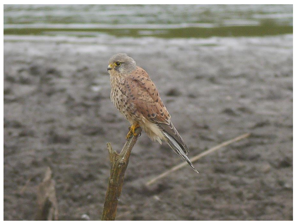
male Kestrel from the Frank Linley hide

six were seen by the Migration Watchers; some at least of these would be seen at a distance from the Reserve itself.