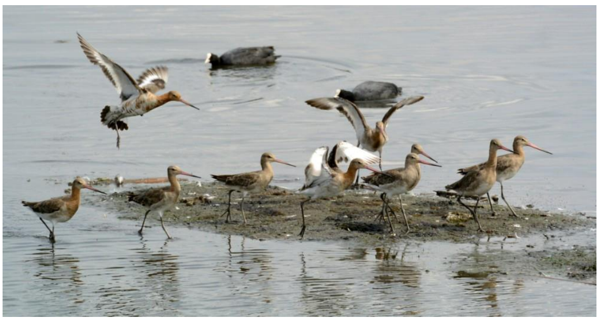
Black-tailed Godwits on No.3 bed in June

Despite being red-listed, this species is seen in ever-increasing numbers and this was a record year with no less than 175 records. Nine circled No.3 bed on 21<sup>st</sup> April but did not land. The next report was of 26, again on No.3 bed, on 9<sup>th</sup> June, increasing to 119 two days later and a year maximum of 211 on the 13<sup>th</sup>. This is a record figure for Woolston, more than doubling the previous highest total of a hundred in 2001. These numbers were short-lived but birds remained in smaller numbers with regular counts of 15 to 35. There were reports of five on the Loop of No.4 bed on 1<sup>st</sup> August and six in the same area on 20<sup>th</sup> September. This month saw numbers increase again on No.3 bed with 54 on the 1<sup>st</sup> rising to 86 on the 17<sup>th</sup>. Up to 34 remained into October but only single-figure counts were submitted for November and December with the last sighting on 25<sup>th</sup> December, the latest ever sighting of this species at Woolston. On 2<sup>nd</sup> December the two on No.3 bed were considered to be an adult and a first winter bird of the islandica race.