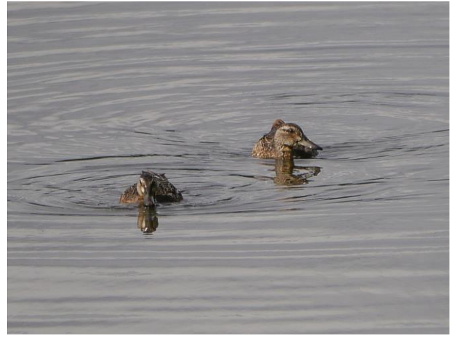
Garganey in August

There were more records than usual of this scarce, amber-listed, summer visitor, beginning with a drake on No.3 bed on 24<sup>th</sup> April. Another drake was seen by four different observers on 22<sup>nd</sup> May and the same (or another) on 16<sup>th</sup> and 18<sup>th</sup> June. An eclipse male was present on 9<sup>th</sup> July in the north-east pools on No.3 bed and the same observer had four sightings of at least two Garganey in sheltered pools inside the east bank of No.3 bed in late August, one of which was thought to be a juvenile. The possibility that breeding could have taken place cannot be ruled out.