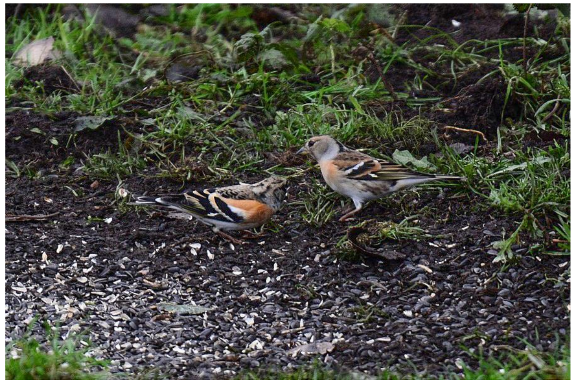
Brambling under No.3 bed feeders