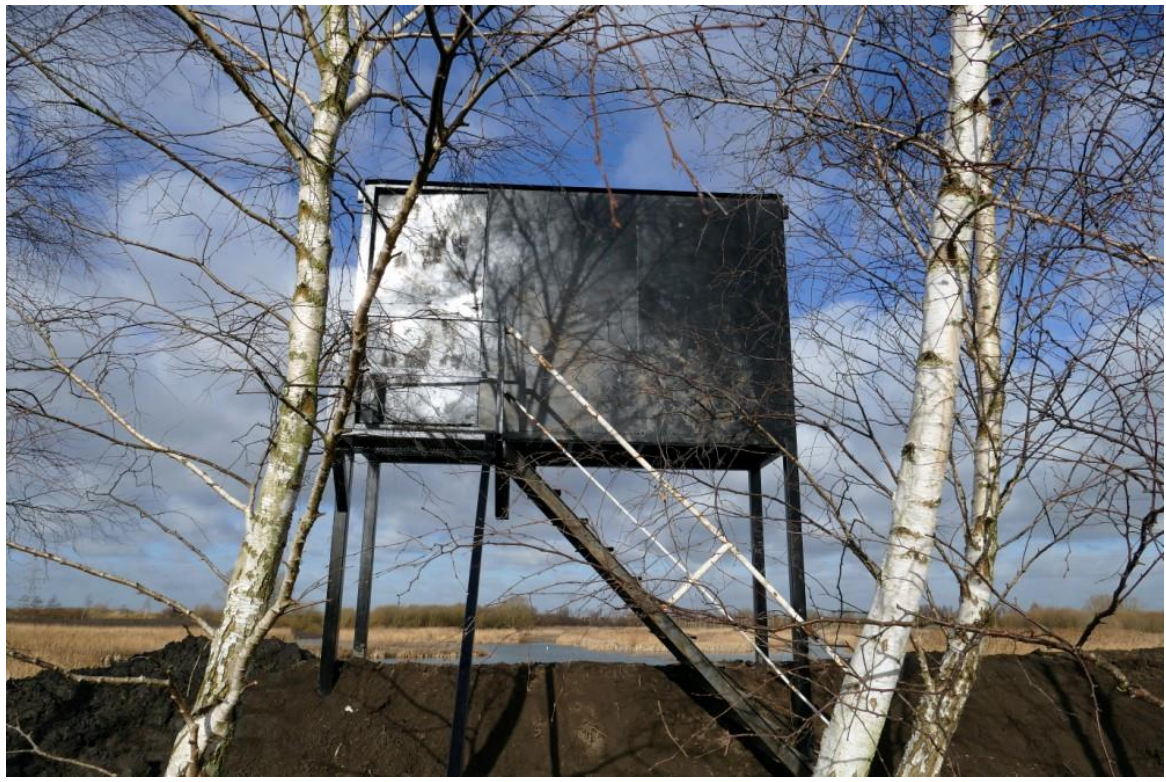
The new hide on No.4 bed in January