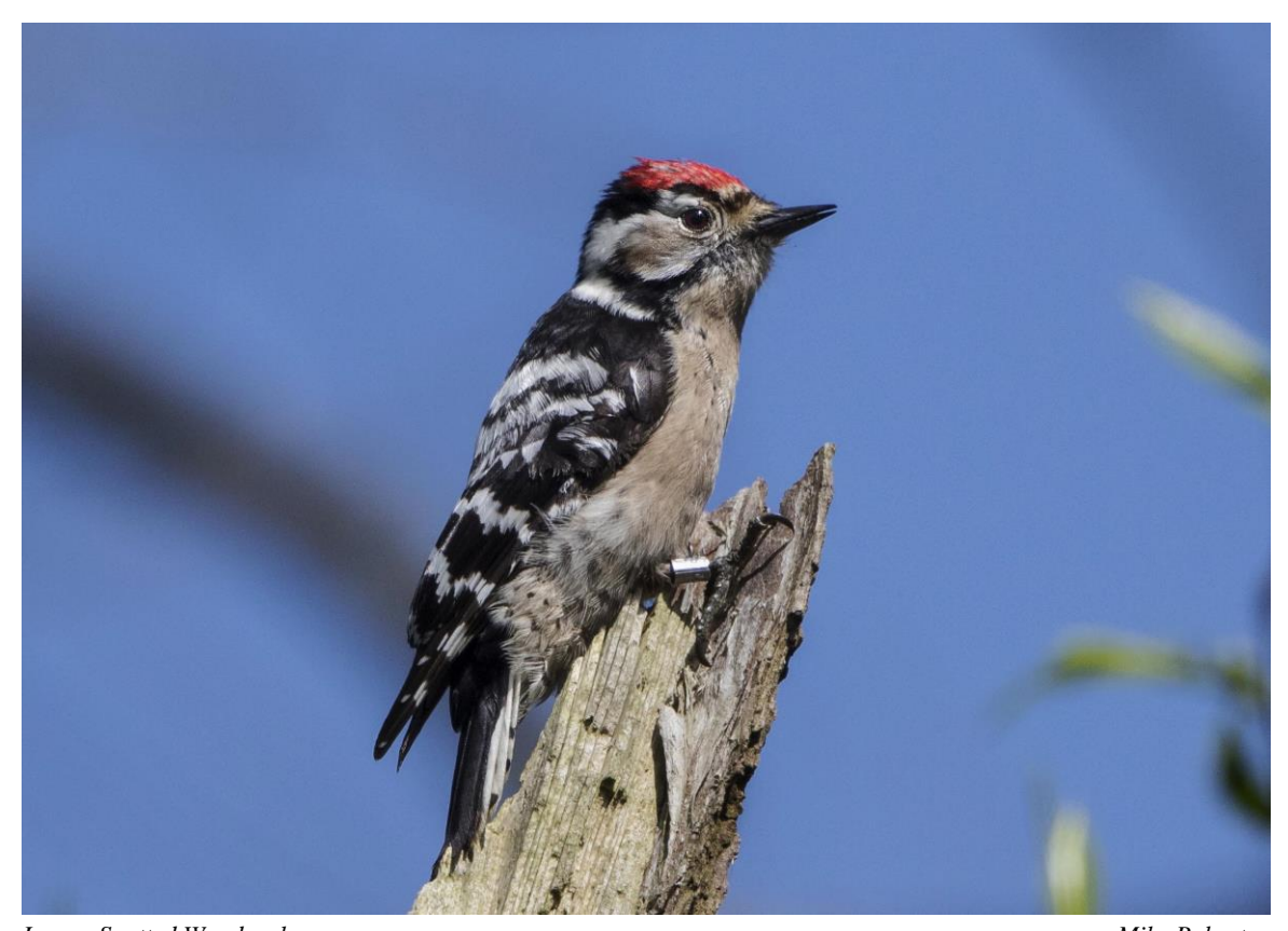
Lesser-Spotted Woodpecker