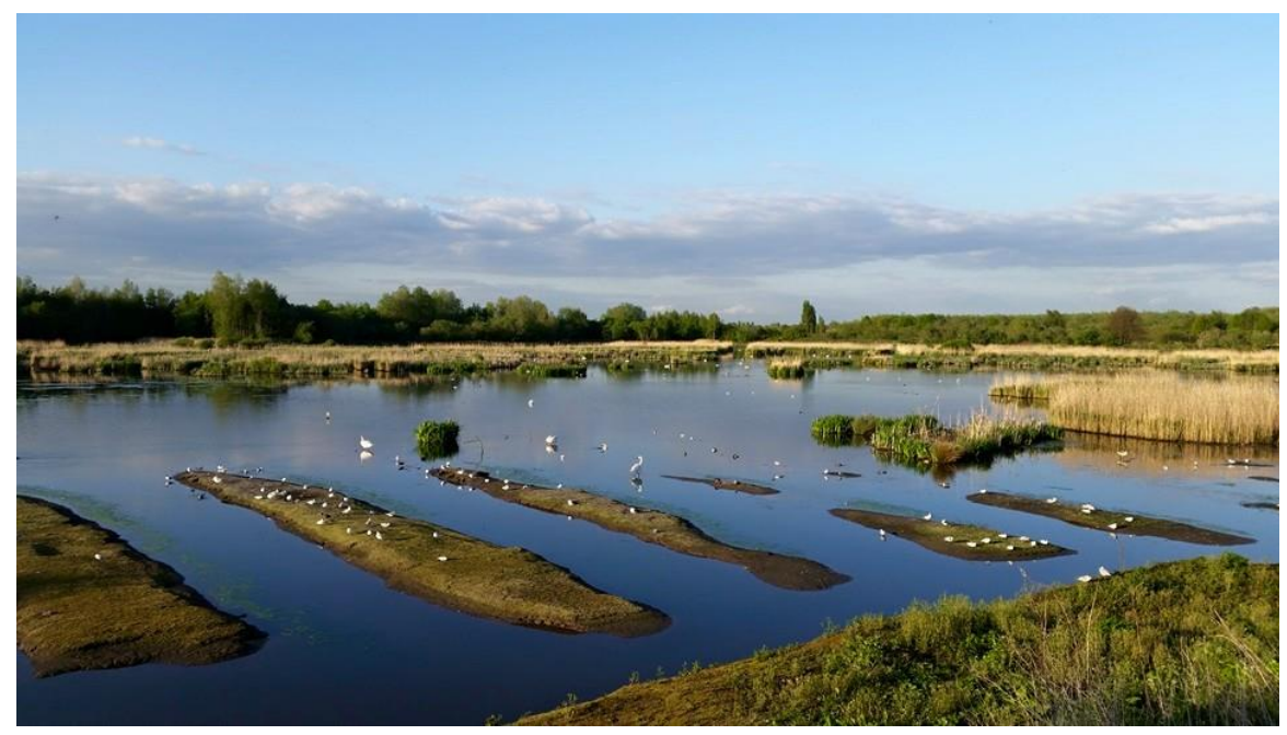
View from the John Morgan hide in May