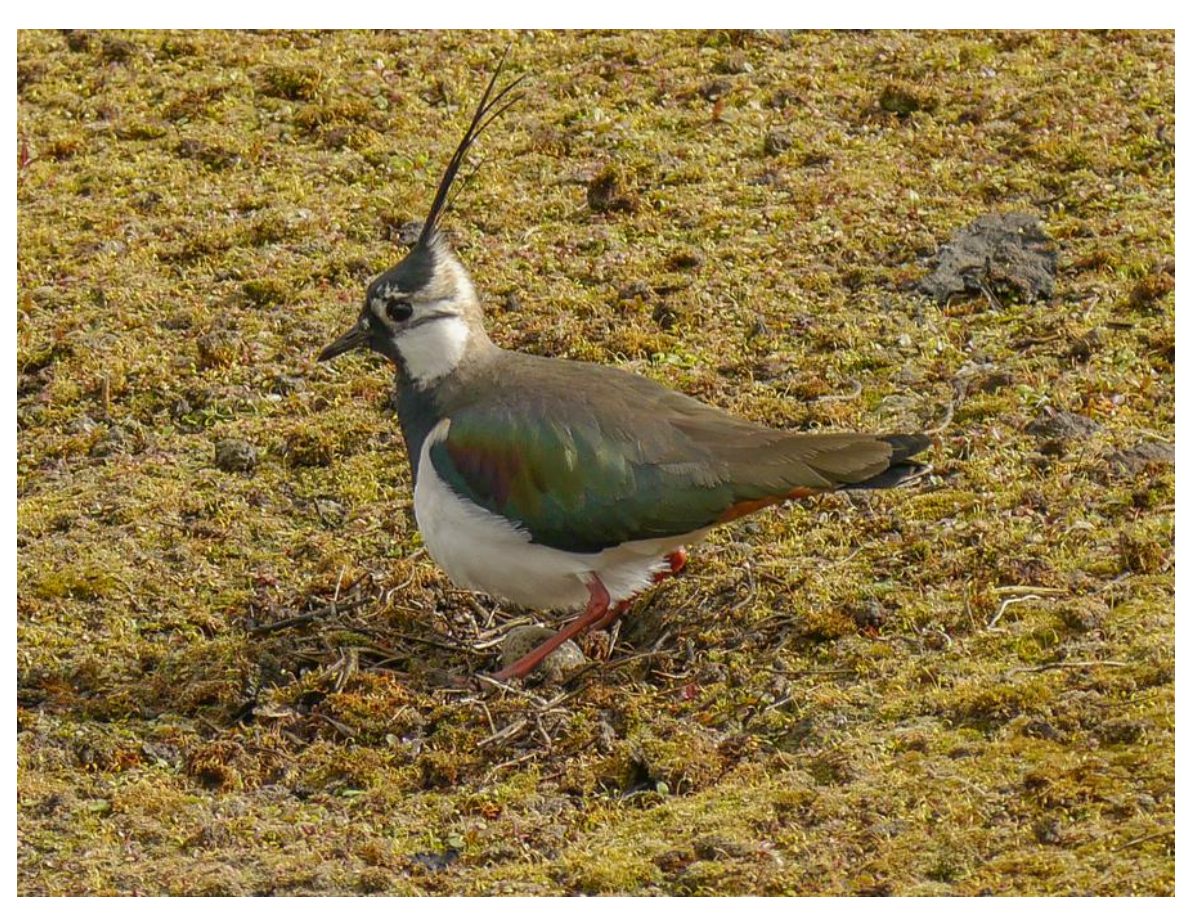
Lapwing nesting in front of the John Morgan hide

From mid-July there was a build-up on No.3 bed, with 83 on the 16<sup>th</sup> increasing to 128 on the 25<sup>th</sup>. Numbers continued to increase during August; 135 were on No.3 bed on the 15<sup>th</sup> whilst, on the 20<sup>th</sup> 130 were on No.3 bed and a further 50 on the Loop. On 26<sup>th</sup> August 333 were counted on No.3 bed and over 400 were recorded in mid-September. The year's maxima were on 10<sup>th</sup> October when 785 flew west and on the 22<sup>nd</sup> when, with water levels very low on No.3 bed, no less than 765 were congregated in the shallows. This is the highest total since 2006. A few days later numbers had decreased to around 400 and by mid-November none remained. For the remainder of the year records consisted of flocks over-flying with a maximum of 390 moving west on 21<sup>st</sup> November.