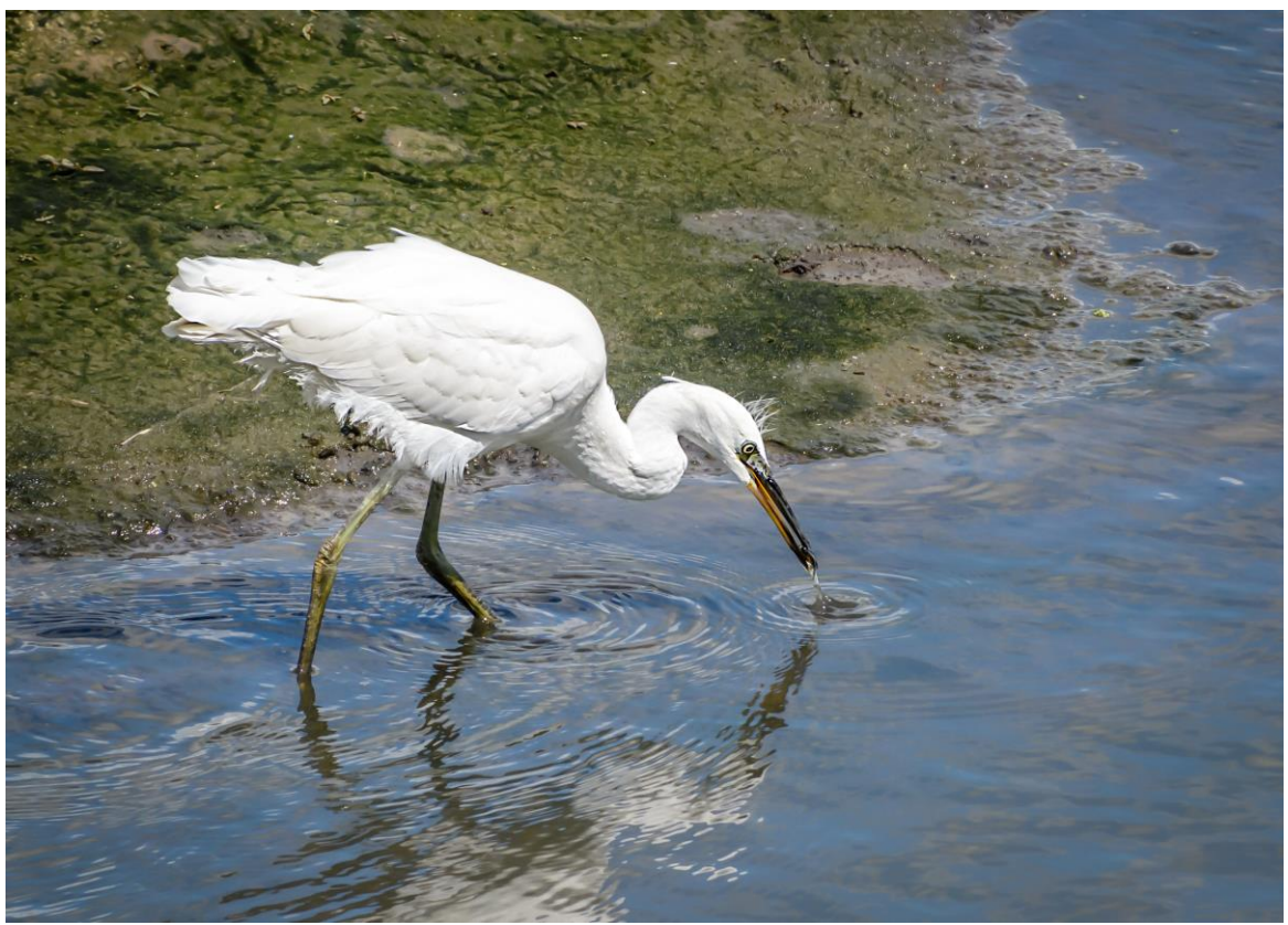
Little Egret from the John Morgan hide

Remains a scarce bird at Woolston, with 11 records, probably referring to just five individuals, between 7^{th} July and 2^{nd} September. Why this should be so is not clear. In fact, there were actually more sightings of the scarcer Great White Egret in 2015.