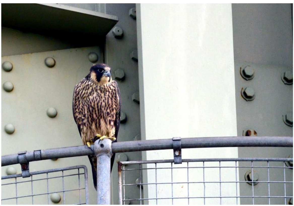
Juvenile Peregrine on viaduct

perched on the structure. A juvenile was found on the concrete base of the Viaduct on 23<sup>rd</sup> June and it allowed the observer to approach within a few yards before hopping away. One of the adults was present nearby and calling loudly so observations were cut short. The last report of the year was on 21<sup>st</sup> November when a male flew low over No.3 bed flushing a flock of Teal.