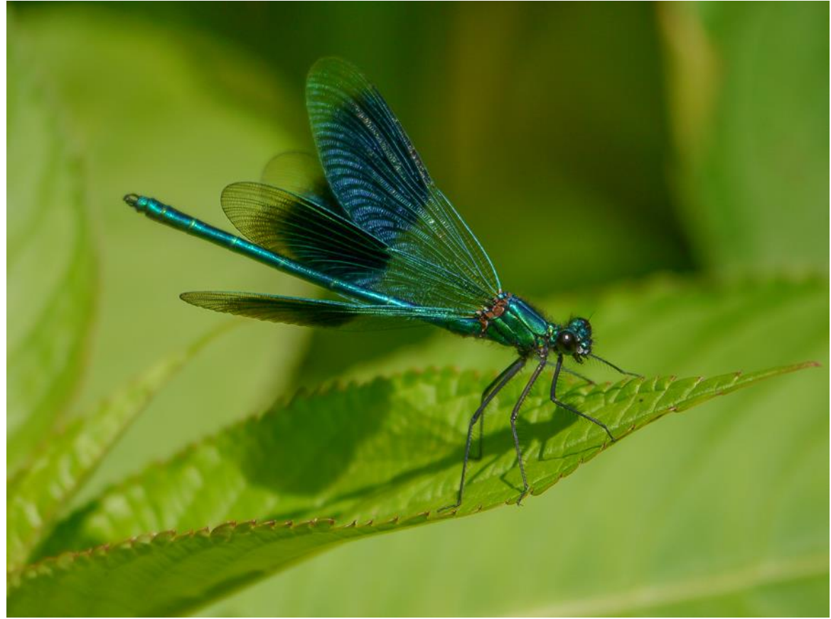
Banded Demoiselle on No.3 bed

These large and colourful damselflies are usually found by slow-flowing rivers, brooks, and canals containing muddy sediment. The metallic-blue males have a fluttering flight action and are often mistaken for butterflies, but the shy metallic-green females are more difficult to find and are probably under recorded. This species has been present in small numbers on the Reserve since at least 2007, when breeding was first confirmed. Typically there were six records this year, beginning with 3<sup>rd</sup> June, when one was spotted on the east bank of No.4 bed. The lush vegetation alongside the Mersey, at the Weir basin is a favourite perching area for this species and four were recorded here on 23<sup>rd</sup> June. A single was also found at this spot, by the same observer, on 30<sup>th</sup> June. A wandering male was then discovered on No.3 bed on 9<sup>th</sup> July. On a warm and sunny 15<sup>th</sup> July, two were recorded, during a butterfly count. Later that same afternoon, a male was seen flying around the riverbank vegetation by the Weir, probably searching for a female.