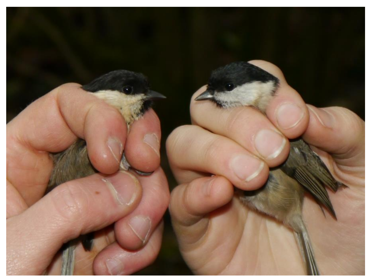
Willow (left) and Marsh (right) Tit

On No.3 bed 11 new birds were ringed during the year. This is below the 12 year average of 16.5 birds and is the lowest total since 2008 when just nine were ringed. The first fledged juvenile was ringed on 27<sup>th</sup> June. This is the latest date in the last 12 years. Nine of the birds ringed were juveniles. Birds were retrapped from the following years: three from 2014, one from 2013, and one from 2012.