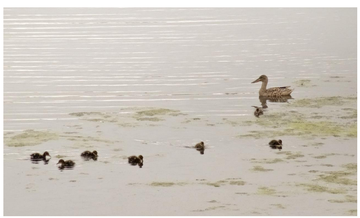
Shoveler brood on No.4 bed

From records submitted to CAWOS the January 2014 maximum count should be 100 <u>not</u> 52, and the July 2014 maximum 30 <u>not</u> 3 as indicated in the 2014 Report.